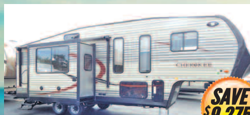
2016 Cherokee 255P Fifth Wheel 2 slides, rear kitchen, MSRP $33,270.

People from all over Northern Michigan are finding Petoskey RV USA has the best prices on Utility Trailers and RV's in the area. Stop in this week for some of the best prices of the summer.