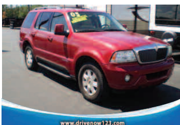
2003 LINCOLN AVIATOR PREMIUM AWD Three Row, Luxury SUV ONLY $200 DOWN