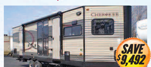
2016 Cherokee 274 VFK Travel Trailer

Solar prep, backup camera, power tongue jack, slideout, power awning. MSRP $30,487.