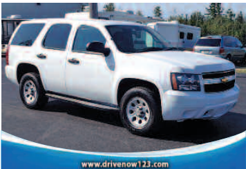
2010 CHEVY TAHOE 4WD $4000 below NADA NOW ONLY $18,000*