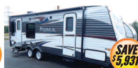
2015 Puma by Palomino 25 RS Travel Trailer

Super price on a family size trailer. MSRP $21,926.