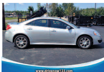
2009 PONTIAC G6 GT SEDAN Fun to drive V6 ONLY $500 DOWN