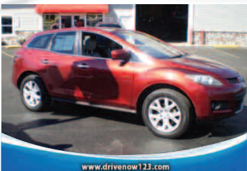
2007 MAZDA CX-7 TOURING AWD Loaded Compact SUV ONLY $200 DOWN