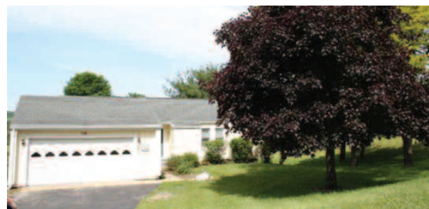
116 LAKEVIEW DRIVE, BEAST JORDAN