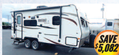
2016 Rockwood Mini Lite 2109 S Travel Trailer Slideout. MSRP $23,073.