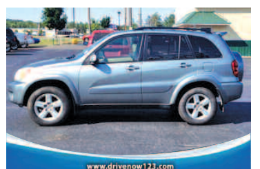
05 TOYOTA RAV4 AWD Gas Saver, You can't go wrong ONLY $500 DOWN