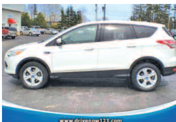
2013 FORD ESCAPE AWD Like New, Top selling Compact SUV ONLY $262*/MONTH