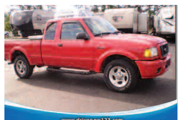
2004 FORD RANGER XLT SUPERCAB Great Compact Truck! NOW ONLY $6,895*