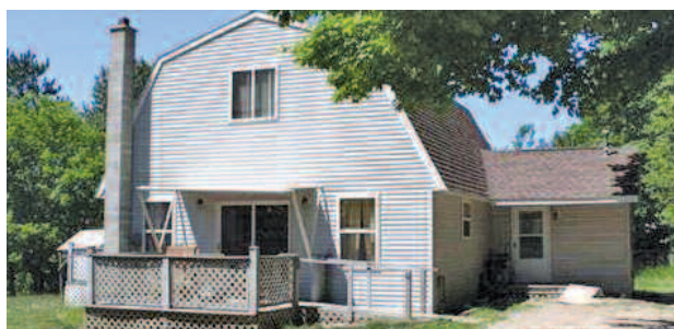
6878 Boss Road • Ellsworth