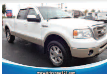
2007 FORD KING RANCH F150 Top of the Line 4X4 ONLY $399*/MONTH