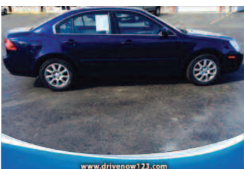
2006 KIA OPTIMA LX Kia, Great fuel economy, room for five ONLY $200 DOWN