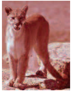
Cougars were originally native to Michigan. Over the past few years numerous sightings have been reported from various locations.

Cougars are primarily nocturnal although they can be active during the day. They are solitary and secretive animals that prefer to hunt from cover. Cougars have a relatively short life span - 8 to 12 years. Over most of its range the cougar's primary wild prey is deer. Cougars are opportunistic predators and will take prey of varying sizes up to and including young moose. Occasionally, livestock and domestic dogs are also taken as