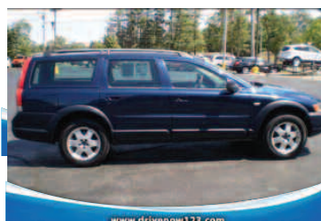
2001 VOLVO XC70 AWD Well equipped, won't last long NOW ONLY $4,795*