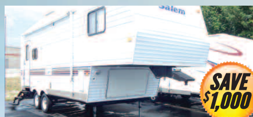
Used 2002 Salem 25 RLSS Travel Trailer Slideout, Regular $8,995.