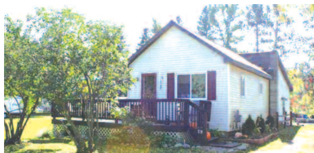
405 UNION STREET, EAST JORDAN

Beautiful 3 bedroom home with peaks of Lake Charlevoix and shared waterfront access to Lake Charlevoix. Finished basement with attached heated garage, home also offers central air for those warm summer days. Mature trees throughout the property. Great views from the deck as well as a nice recroom with walk out basement and area for grilling and relaxing in the shade. MLS 444859. Ask for Mike Stark or Holly Nierman. $179,900