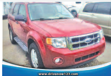
2012 FORD ESCAPE XLT FWD 2nd Row Folding Seat, Alloy Wheels NOW ONLY $11,999*