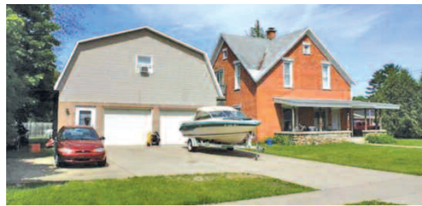
407 THIRD STREET, EAST JORDAN

A very nice larger parcel that offers a little bit of everything!! Nicely wooded areas and some open fields. The possibilities are endless with this parcel. Great Hunting in the area. Large enough for that family retreat or hunting camp. Maybe even that golf course or camp ground you have always thought about building. Only a couple miles from downtown East Jordan!MLS 441891. Ask for Chris Oliver. $169,000