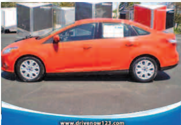
2012 FORD FOCUS SE SEDAN Air, Cruise, CD Changer ONLY $199*/MONTH