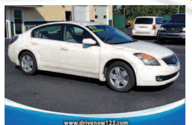
2007 NISSAN ALTIMA Fuel Efficient, mid size sedan ONLY $199*/MONTH