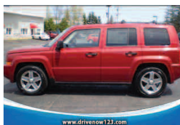
2007 JEEP PATRIOT SPORT 4WD Fuel efficient SUV ONLY $195*/MONTH