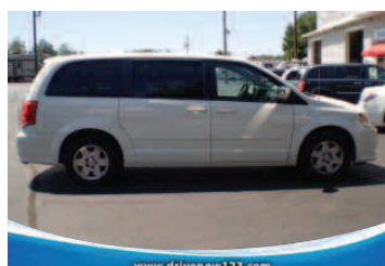
2011 DODGE GRAND CARAVAN EXPRESS Vacation Ready, with stow and go NOW ONLY $10,995*