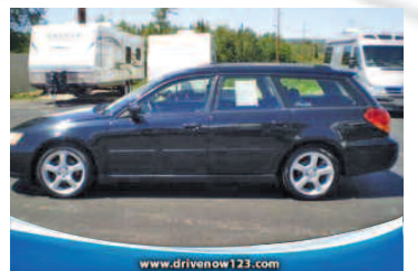
2006 SUBARU LEGACY 2.5 i LIMITED A Northern Michigan Favorite! NOW ONLY $9,299*