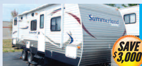
Used 2013 Summerland by Springdale 2670 BH 5th Wheel Slideout, Regular $15,995.