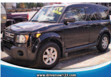
2007 HONDA ELEMENT EX 4WD AT One Owner, Great Shape ONLY $239*/MONTH