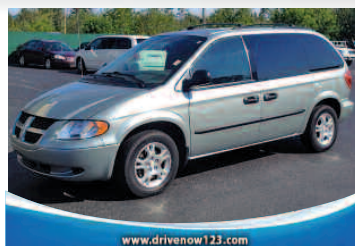
2006 DODGE CARAVAN SE Great value! ONLY $200 DOWN