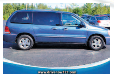
2006 FORD FREESTAR LIMITED All the bells and whistles ONLY $200 DOWN