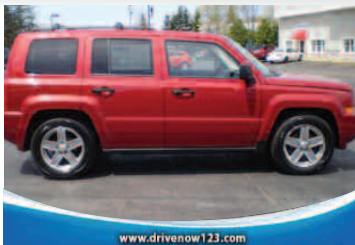
2007 JEEP PATRIOT SPORT 4WD Fuel Efficient SUV ONLY $179*/MONTH