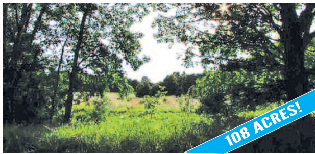
000 OLD GRAHAM, EAST JORDAN

What an amazing backyard, a fire pit with hand carved logs to sit on for entertaining, great landscaping and a deck too. Now for the inside.. hardwood floors, Freshly painted, newly updated kitchen and bathroom, look at those kitchen cupboards. Call today to set up your personal tour! MLS 438606. Ask for Holly Nierman. $74,900