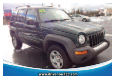
2002 JEEP LIBERTY SPORT 4WD 2nd Row Folding Seat, Tow Package ONLY $159*/MONTH