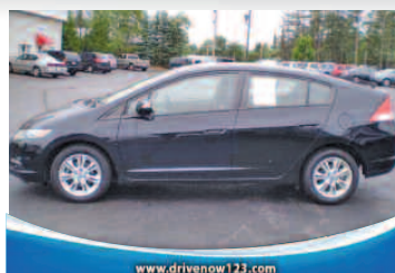
2010 HONDA INSIGHT EX Well equipped hybrid ONLY $169*/MONTH