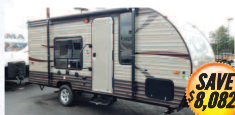
2016 Wolf Pup 16 FQ Travel Trailer

New 2016 Stealth Trailers Titan 8.5 x 20. MSRP $6,995. Sale Price $5,995