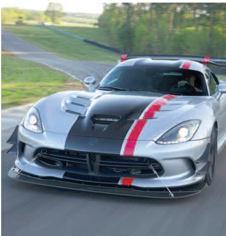
Hand-built in Detroit at the Conner Avenue Assembly Plant; the 2016 Dodge Viper ACR goes on sale in third quarter 2015. VehProf-JeepPhoto1; Jeep® Grand Cherokee – the most awarded SUV ever – ranks highest among Mid-Size SUVs for the fifth consecutive year in AutoPacific's Vehicle Satisfaction Awards (VSAs).

Track duty can punish the brakes. The 2016 Dodge Viper ACR features new Brembo® Carbon Ceramic Matrix brakes for optimum braking performance