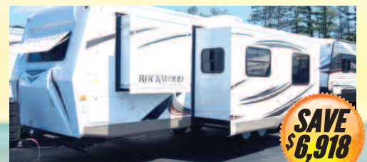
2016 Rockwood Ultra Lite 2702 WS Travel Trailer 2 slideouts, power tongue jack, 4 power stab jacks, outside grill. MSRP $32,913.