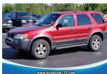
05 FORD ESCAPE XLT 4X4 Low Mileage, Compact SUV ONLY $200 DOWN