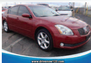
2005 NISSAN MAXIMA Must see, nicely equipped ONLY $200 DOWN