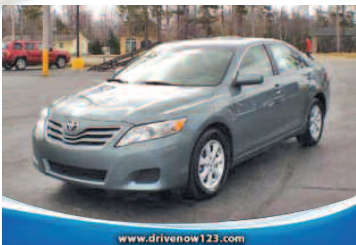
2011 TOYOTA CAMRY Americas #1 Selling vehicle NOW ONLY $13,249*