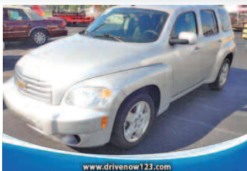
2010 CHEVROLET HHR LT2 Chrome Wheels, Tinted Glass, OnStar ONLY $500* DOWN