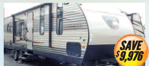
2016 Cherokee Limited 274 RR Travel Trailer Power awning, slide, backup camera, power tongue jack. MSRP $29,971.