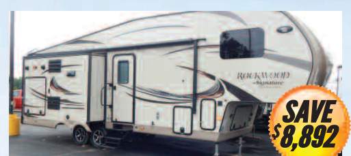
2016 Rockwood Signature Ultra Lite 8288 WSA 5th Wheel 3 slideouts, luxury package, outside grill, fireplace. MSRP $46,887.