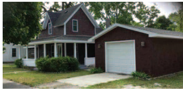
306 GARFIELD STREETCITYEAST JORDAN

Solid brick home that has been converted into 3 units. Very good tenant history. There is also a 2 car insulated finished garage. This also offers a shared laundry room in a very quiet neighborhood close to schools. MLS 444858. Ask for Mike Stark or Holly Nierman. $110,000