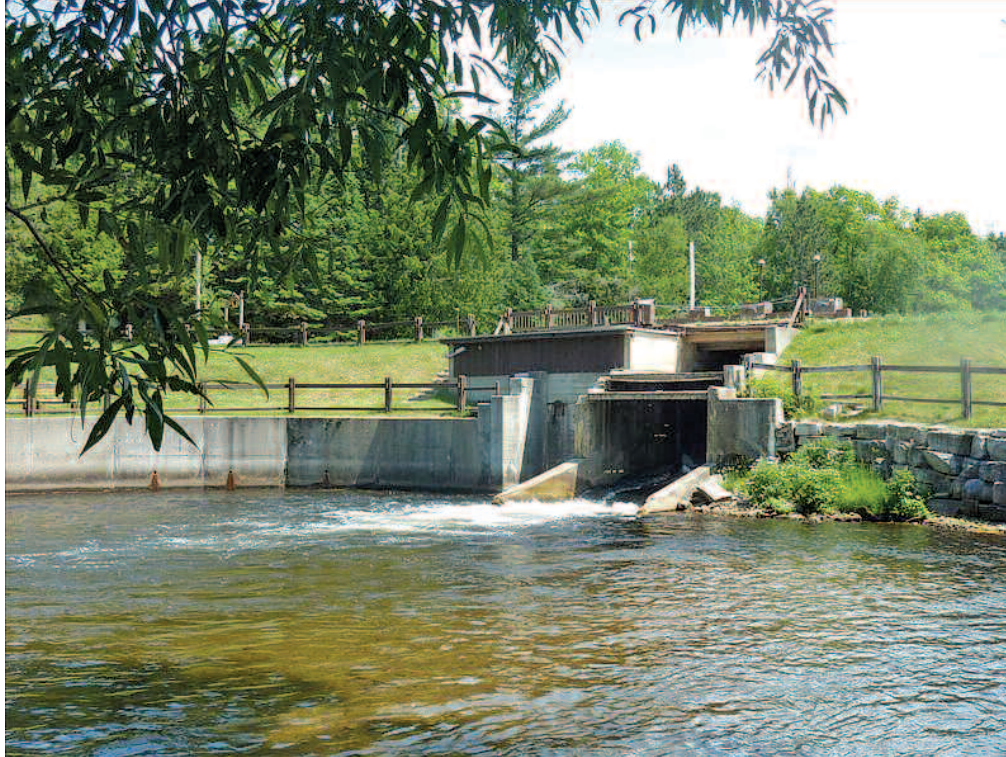
Anglers are encouraged that fishing for brook trout (below) and other species will improve after removal of the Song of the Morning Dam on the Pigeon River (above).

With these improvements anglers have been informed that temporary changes in water appearance will occur. The water may be turbid as if a heavy rain has just occurred. Another important component will be sediment management.