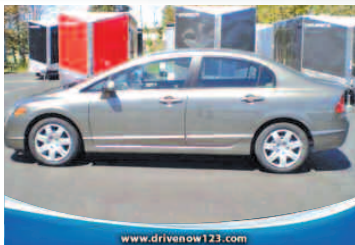
2008 HONDA CIVIC Great Fuel Economy with low miles NOW ONLY $10,259*