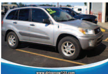
2002 TOYOTA RAV4 4WD Go anywhere, with great gas mileage NOW ONLY $6,495*