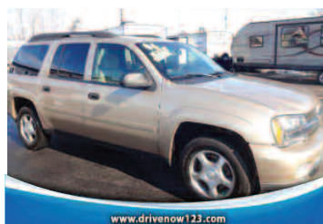
2006 CHEVY TRAILBLAZER EXT LT 4WD OnStar, Rear Air, Tow Pkg. ONLY $189*/MONTH