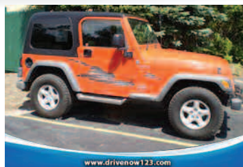
2006 JEEP WRANGLER UNLIMITED Ready for some Off Road Fun! NOW ONLY $12,695*